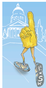
My First 5k